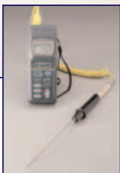
Type PM20700 Digital Pyrometer