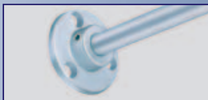
Model 7051—Frame Foot