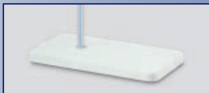
Model 7057—Double Support Base & Rod