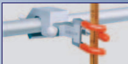
Model 7078—Water Bath Clamp