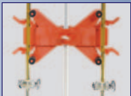
Model 7086—EMR Double Burette Holder