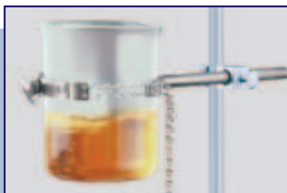
Model 7049—Chain Clamp