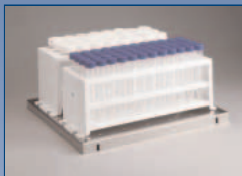
Test Tube Platform