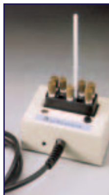
B/T Sure Biological Indicator