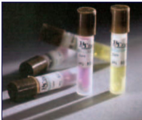
B/T Sure® Biological Indicator Incubator