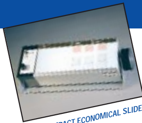
OUR COMPACT ECONOMICAL SLIDE-WARMER!