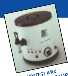
THE HOTTEST WAX DISPENSER IN THE MARKET!