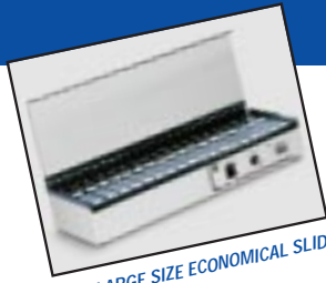
OUR LARGE SIZE ECONOMICAL SLIDE-WARMER!