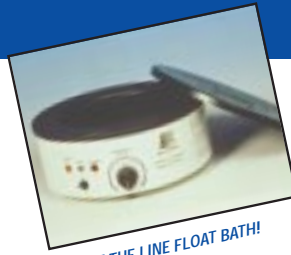
TOP OF THE LINE FLOAT BATH!