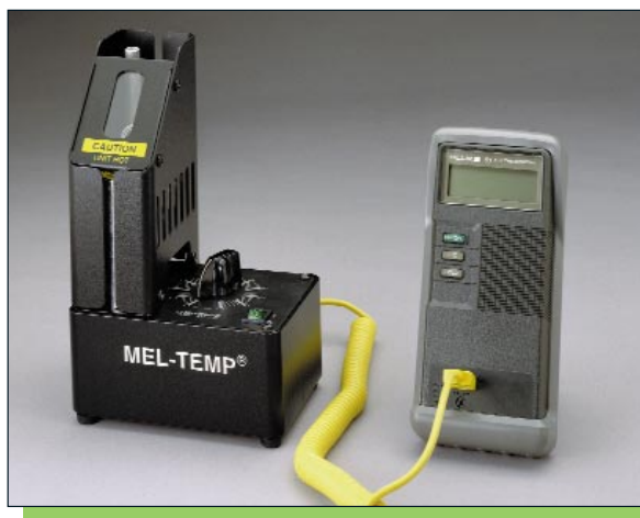
Model 1006 Show with Mel-Temp