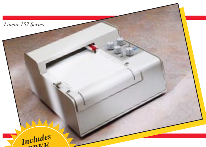
Linear 157 Series

Includes FREE Roll of Chart Paper and Pen!