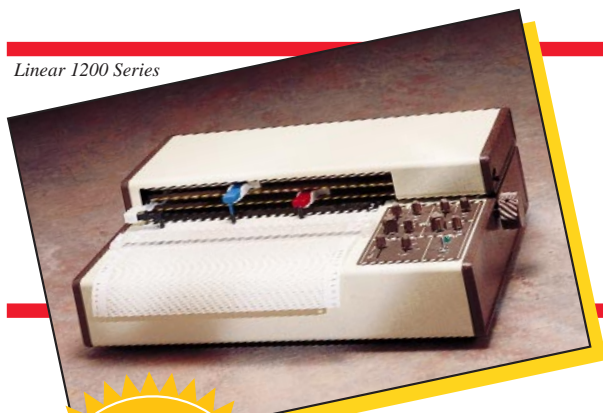
Linear 1200 Series

Includes FREE Roll of Chart Paper and Pen(s)!