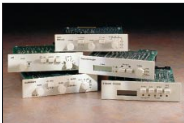
Linear Signal Conditioning Modules

48 Hour or Sooner Express Shipping Guaranteed!*