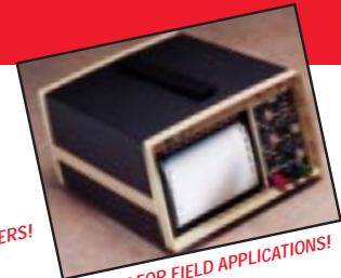
PERFECT FOR FIELD APPLICATIONS!