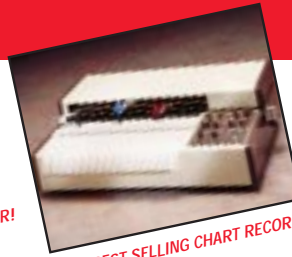
OUR BEST SELLING CHART RECORDERS!