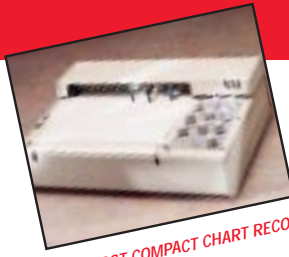
OUR MOST COMPACT CHART RECORDER!