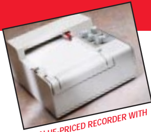
A VALUE-PRICED RECORDER WITH 1001 USES!