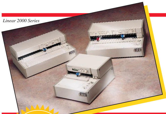
Linear 2000 Series