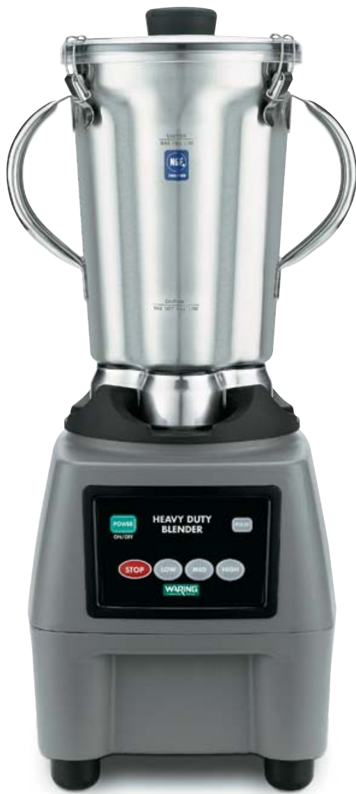
LBC15 Four-Liter Laboratory Blender