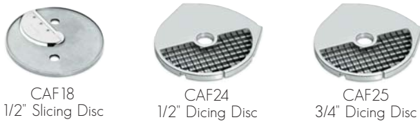
CAF18 1/2" Slicing Disc