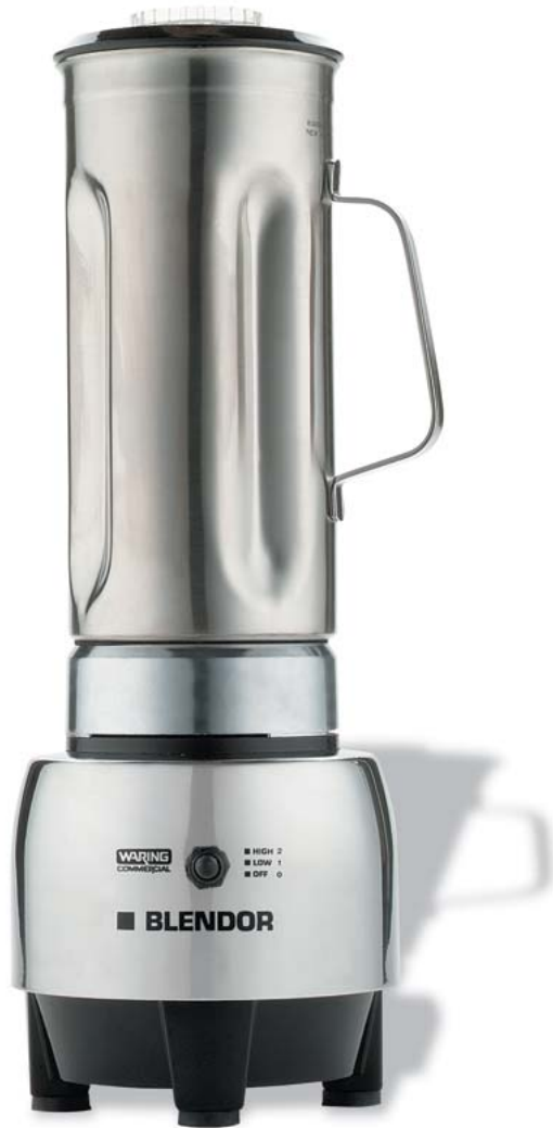
HGBSS Two-Liter Laboratory Blender