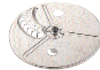
French Fry Cutter FPC90